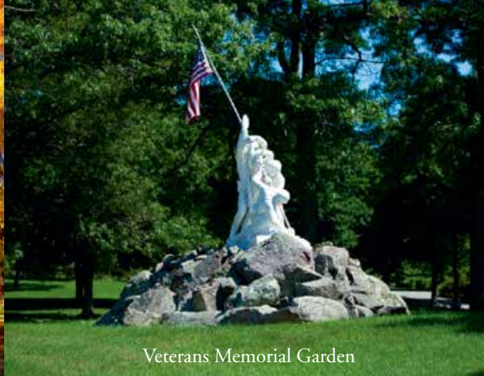
Veterans Memorial Garden

Knollwood Memorial Park is a private not-for-profit cemetery that serves all faiths. It is still expanding and will continue to serve the community for generations to come.